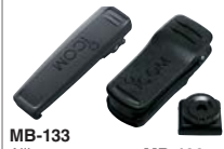
MB-133 Alligator type MB-136 Same as supplied. Swivel type