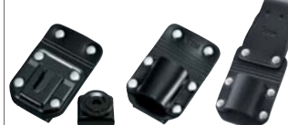
MB-96N MB-96F MB-96FL