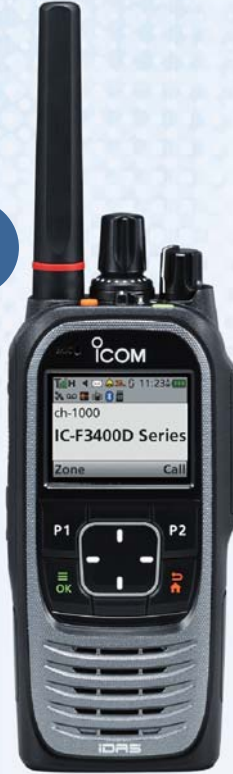
VHF DIGITAL TRANSCEIVER IC-F3400DS UHF DIGITAL TRANSCEIVER IC-F4400DS