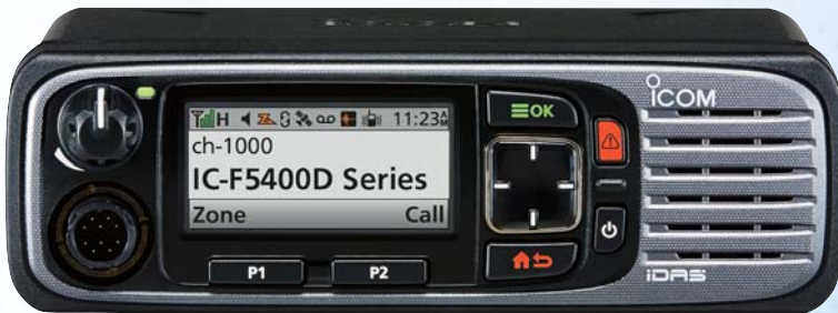
VHF DIGITAL TRANSCEIVER IC-F5400D UHF DIGITAL TRANSCEIVER IC-F6400D