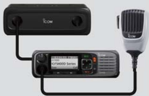
Detached Controller* Optional RMK-5 and separation cable required.

With a combination with optional separation kits, COMMANDMIC and separation cables, three types of controller configurations are available to suit almost any application or installation that may be required. The intercom function is available between controllers and/or COMMANDMIC.