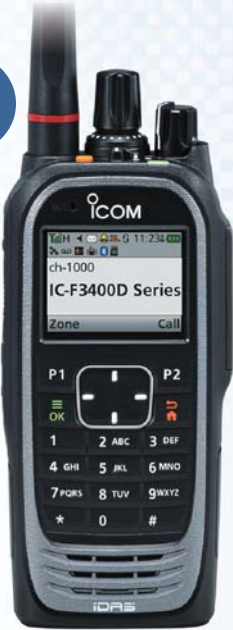
VHF DIGITAL TRANSCEIVER IC-F3400DT UHF DIGITAL TRANSCEIVER IC-F4400DT