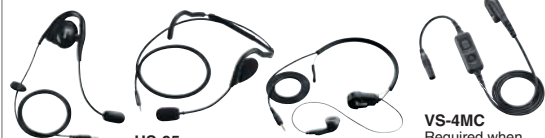
HS-94 Earhook type HS-95 Behind-the-head type HS-97 Throat type VS-4MC Required when using any of these headsets