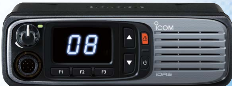
VHF DIGITAL TRANSCEIVER IC-F5400DS UHF DIGITAL TRANSCEIVER IC-F6400DS