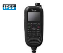
HM-218 Secondary remote control microphone for RMK-5. Options for IC-F5400D/F6400D only.