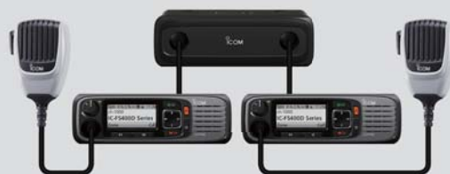
Dual Head Controller* Optional RMK-7, hand microphone and separation cables required.

A detached controller head with the separated RF unit is a simple to install in almost any vehicle.