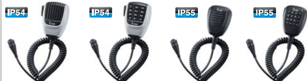
IP54 IP54 IP55 IP55 HM-220 Heavy duty microphone HM-220T Heavy duty microphone with DTMF keypad HM-221 HM-221T DTMF microphone