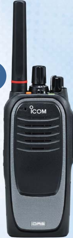
VHF DIGITAL TRANSCEIVER IC-F3400D UHF DIGITAL TRANSCEIVER IC-F4400D