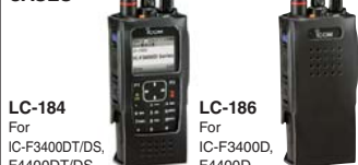
LC-184 For IC-F3400D/DS, F4400D/DS LC-186 For IC-F3400D, F4400D