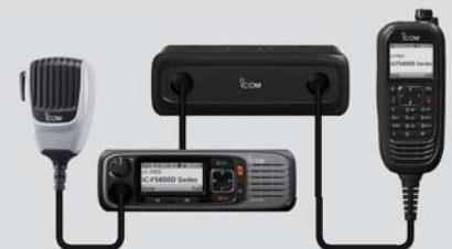
COMMANDMIC™ and Detached Controller* Optional RMK-5, COMMANDMIC, HM-218 and separation cables required.

Suitable for double cab vehicles. Install the controller head to front and rear seats respectively.