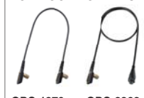
OPC-1870 Handheld to handheld cable OPC-2362 Handheld to mobile cable