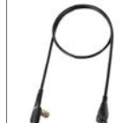
OPC-2362 Mobile to handheld cable