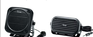
SP-30 20W rated input SP-35: 2m cable SP-35L: 6m cable